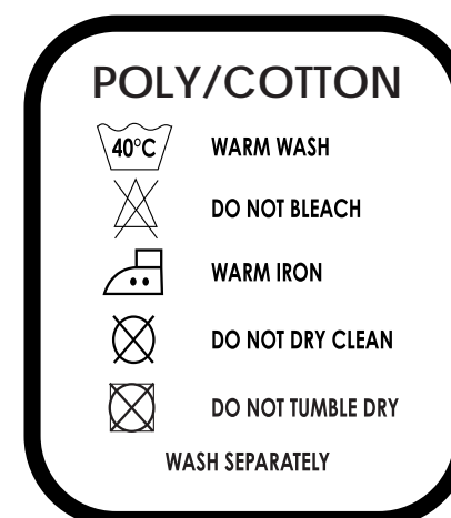
WASHCARE LABEL 3.5cm X 2.5cm