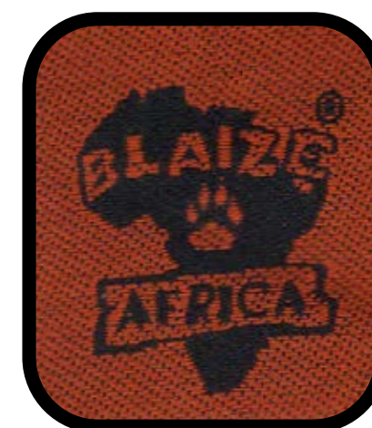
BACK NECK LABEL 3cm x 3.5cm