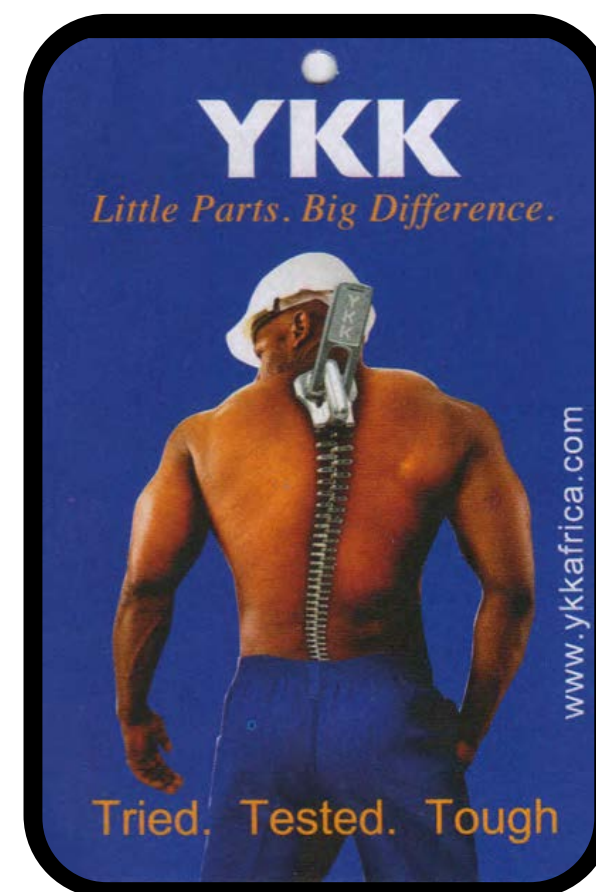
SWINGTAG 8cm X 5.5cm