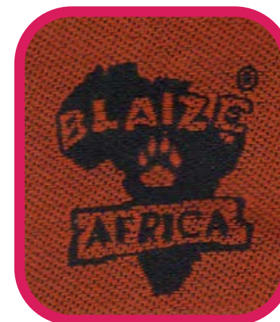
BACK NECK LABEL 3cm x 3.5cm