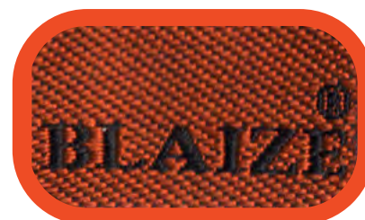
SIDEWINDER 3cm X 2cm