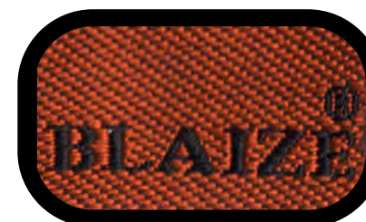
SIDE WINDER 3cm x 2cm