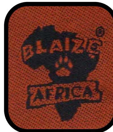
CENTRE BACK LABEL 3cm x 3.5cm