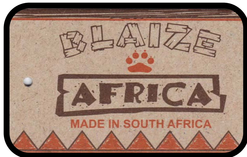
SWINGTAG 8cm x 5cm