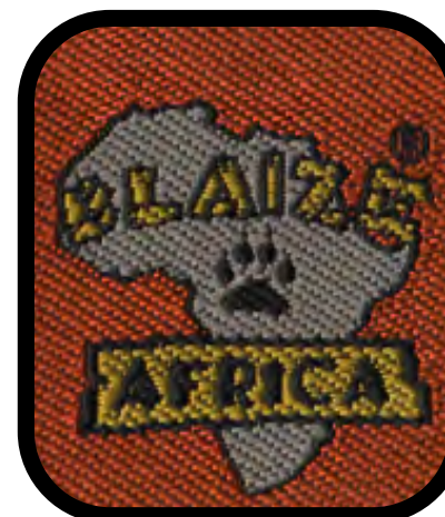
CENTRE BACK LABEL 3cm x 3.5cm