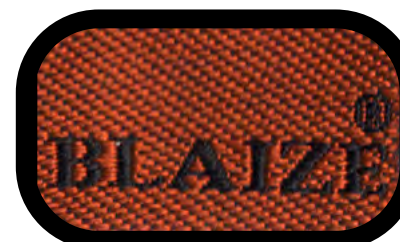
SIDE WINDER 3cm x 2cm