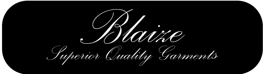
SWINGTAG 10cm x 3cm