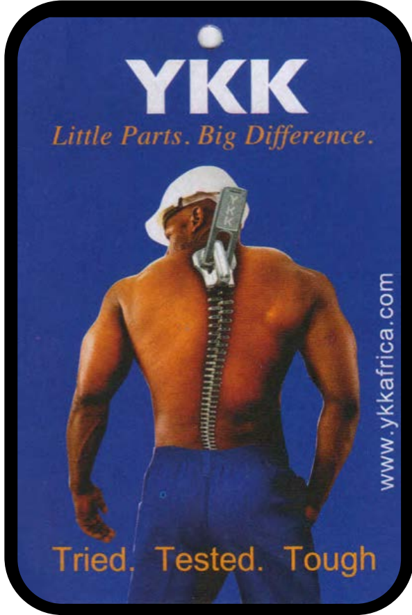
SWINGTAG 8cm x 8cm