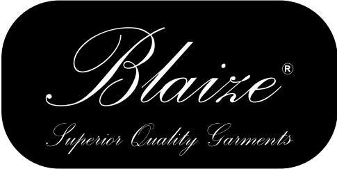
SIDEWINDER 5cm x 2cm