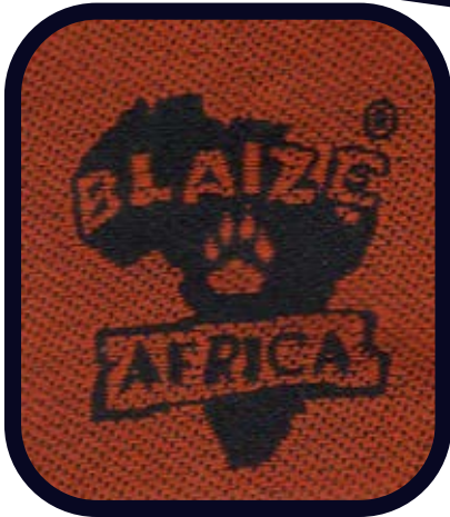
BACK NECK LABEL 3cm x 3.5cm