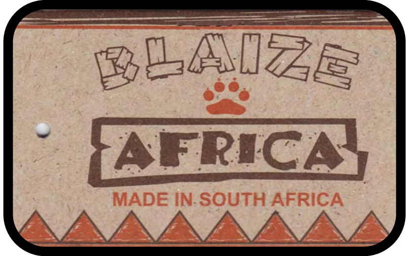
SWINGTAG - 8cm x 5cm